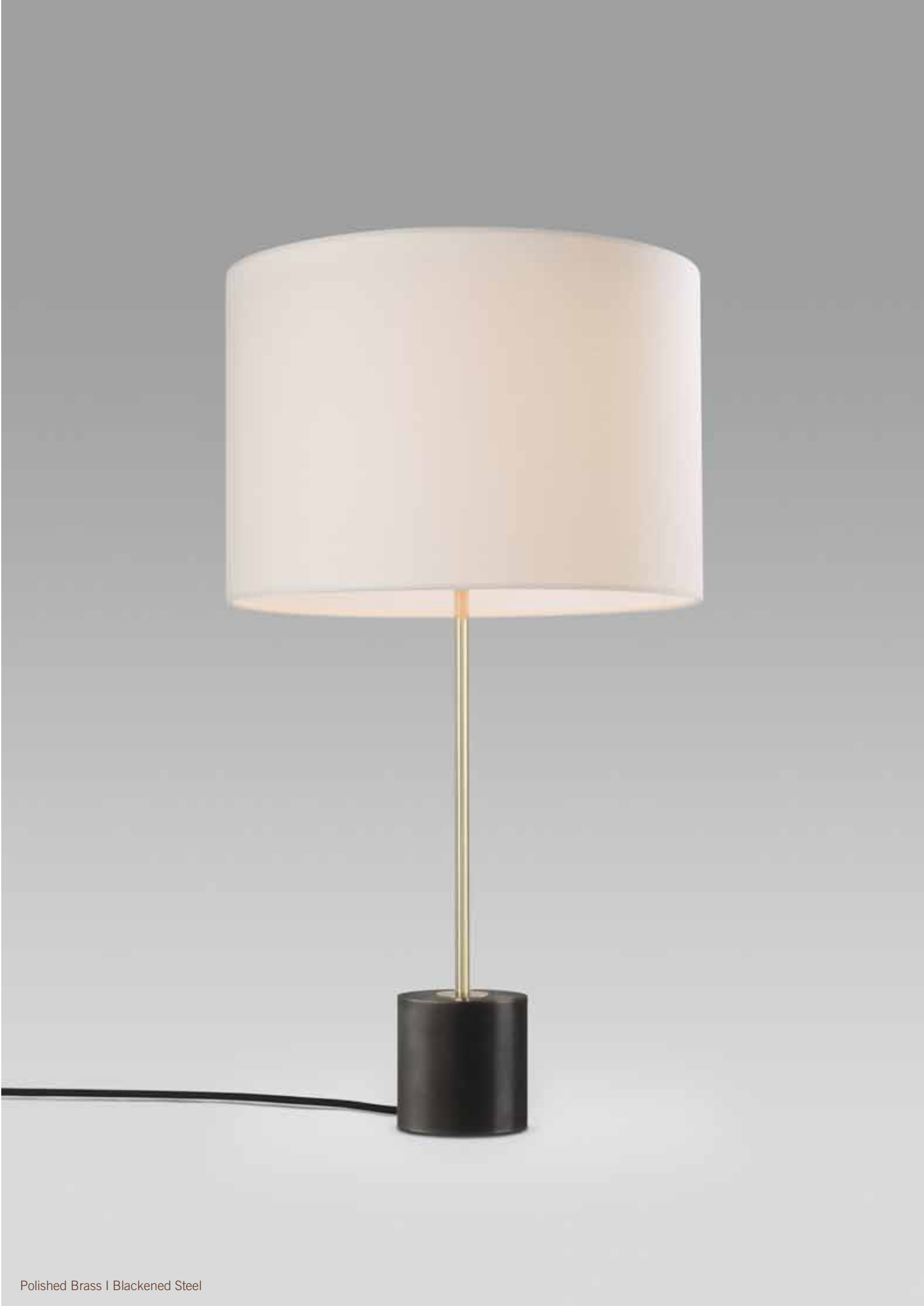
Polished Brass | Blackened Steel